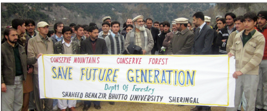
Department of Forestry celebrated the International Mountains Day