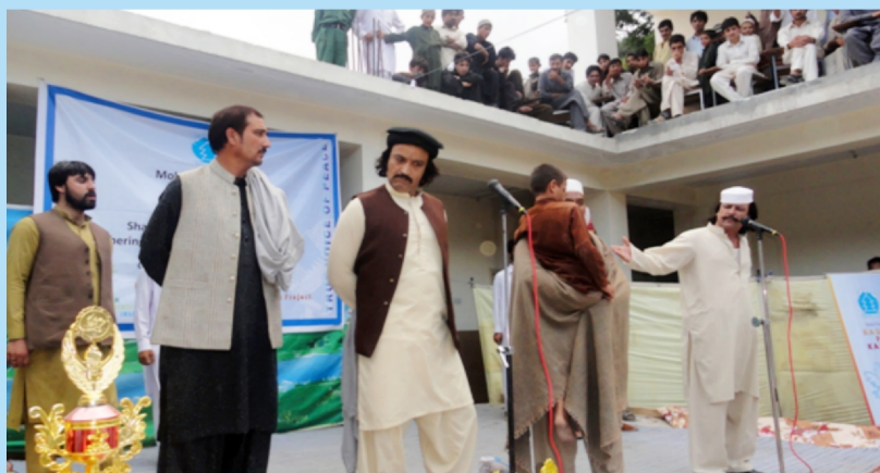
Actors are in action during Stage Drama "Arman" at SBBU Sheringal