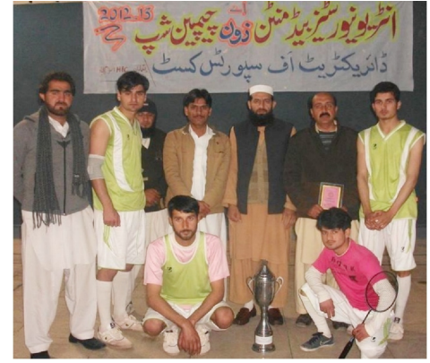
Group photo of SBBU badminton team (the winner of Inter-University Zone A) with the Registrar of KUST