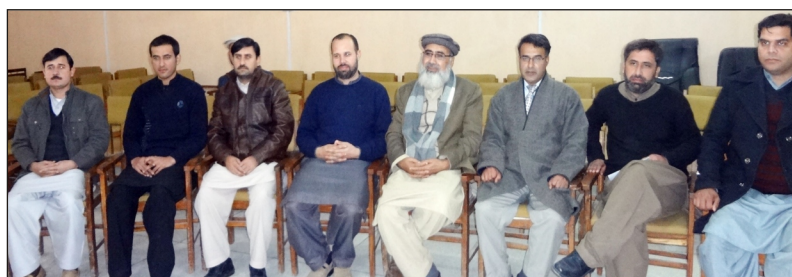
The faculty members of the Department of English with the Vice Chancellor in a function.