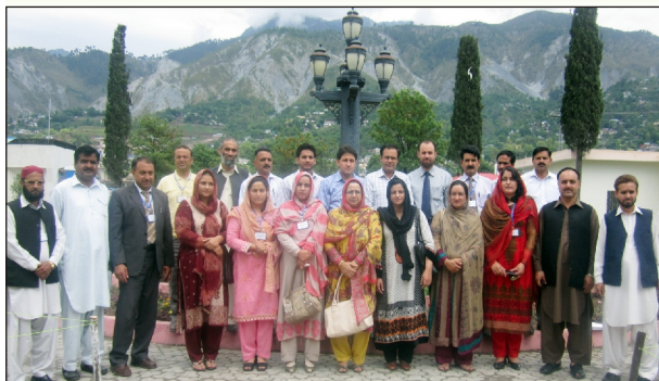
Training participants at TELS workshop, UAJK, Muzaffarabad