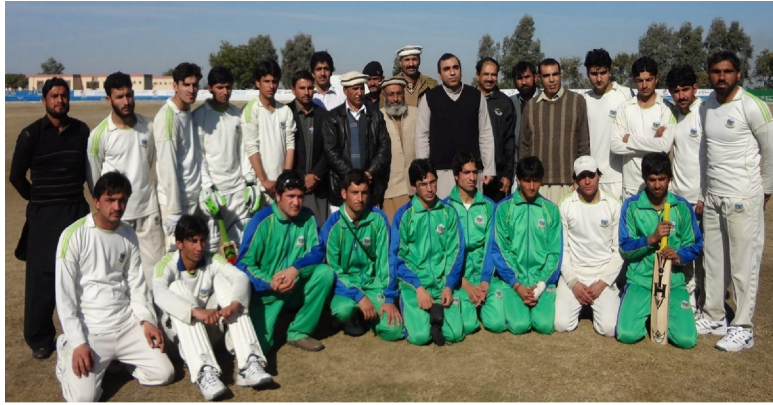
Group photo of SBBU cricket team (the runner up) with the chief guest