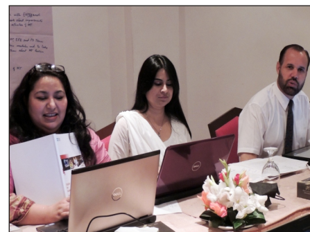
The authors of TELS modules and the experts from British Council during the Final Revision Workshop held in Lahore