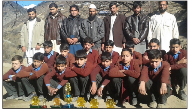
Sport Week at University Public School Badarkani