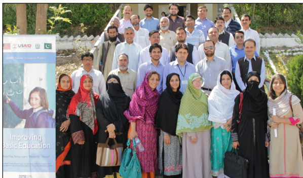
The participants of TELS Abbottabad workshop