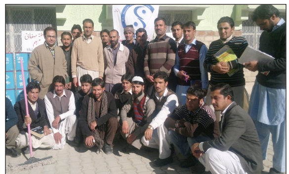
MS Skill Society celebrated the week of cleanliness